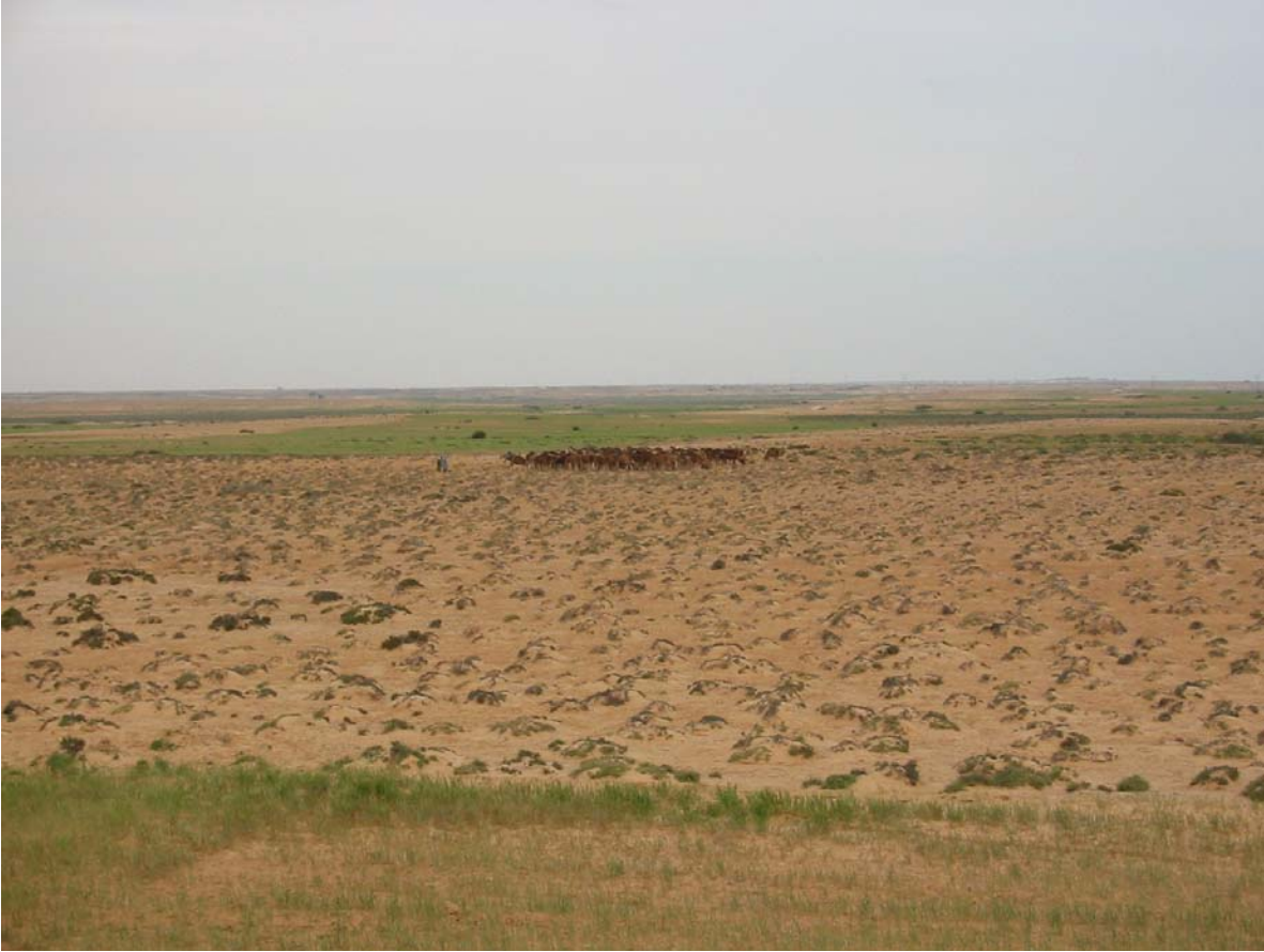
Plate 1. Cereals and halophytes in the downstream area of Oum Zessar watershed.